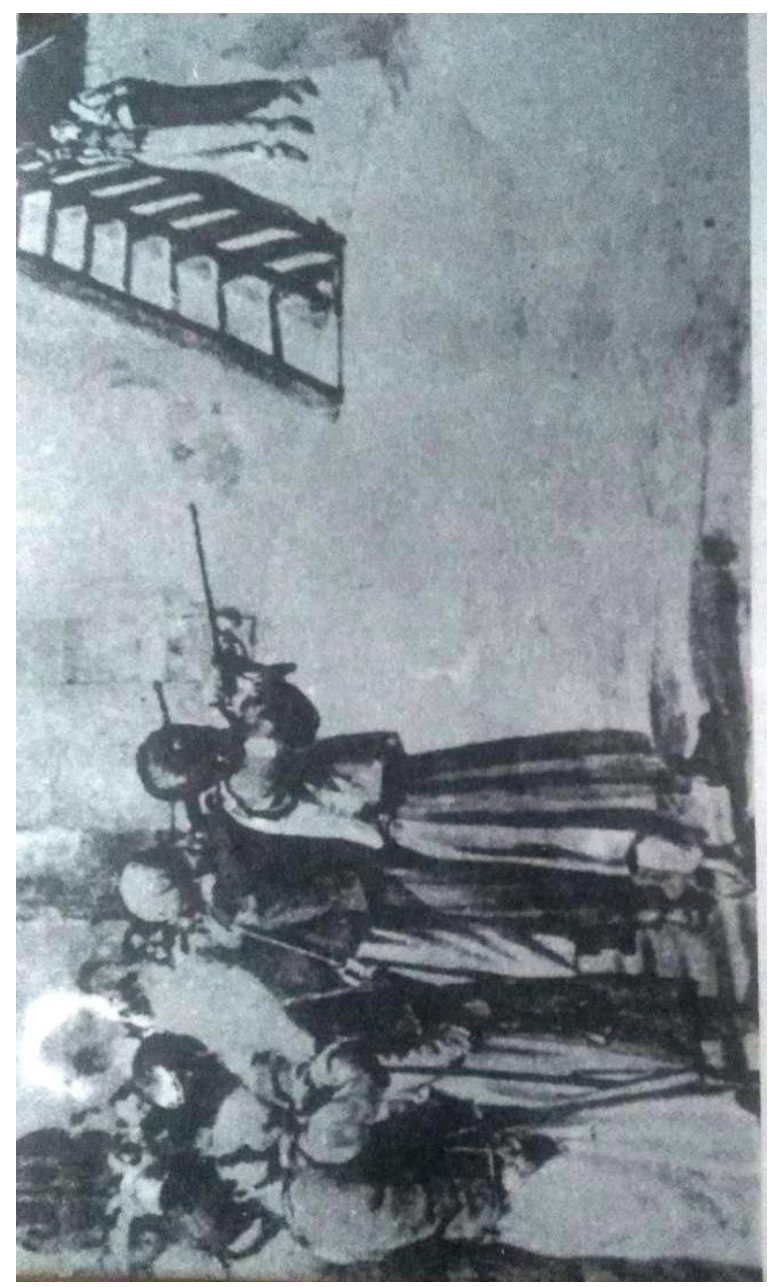
Execution of the Bab. The Person at the Top Right who is Hanging is the Bab Ready to be Shot